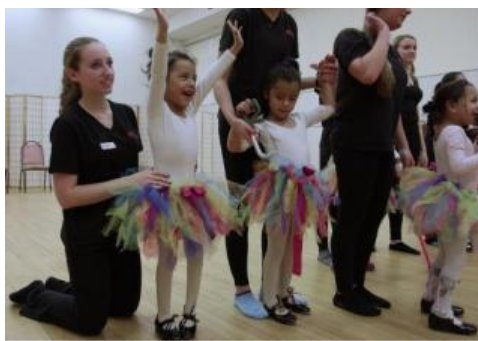
Perfectly Normal for Me

MOVE TO INCLUDE project. Each film sought to educate, inspire, and encourage cultural change to better serve individuals with disabilities which aligns with WILS vision of full community inclusion for individuals with disabilities.