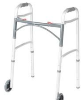
Walker with two wheels