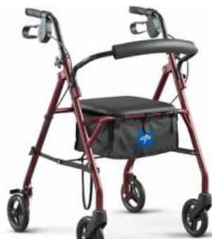
Rollator walker with seat